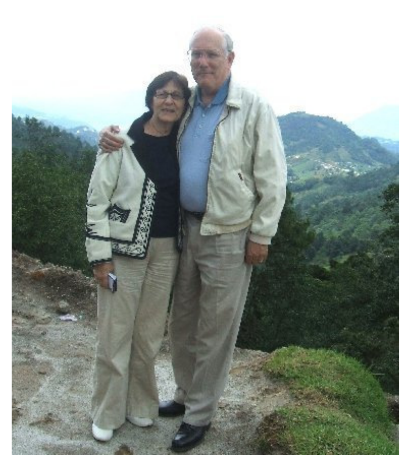
On a mountain in our much loved Guatemala